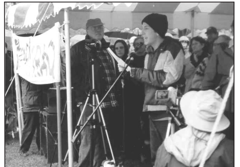
caption...see page 3